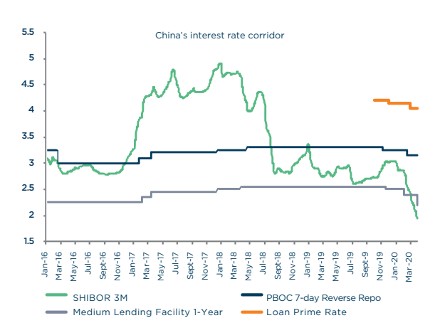
CHART 3 China's interest rate corridor